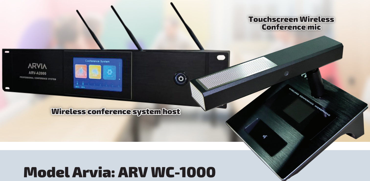
Wireless conference system host