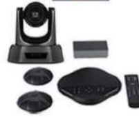
T3000E GROUP + Expansion Mics