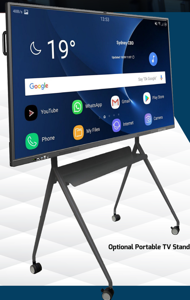
Optional Portable TV Stand