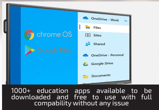
1000+ education apps available to be downloaded and free to use with full compability without any issue