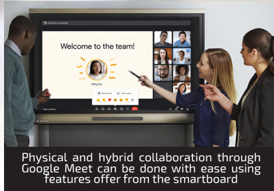
Physical and hybrid collaboration through Google Meet can be done with ease using features offer from the smartboard