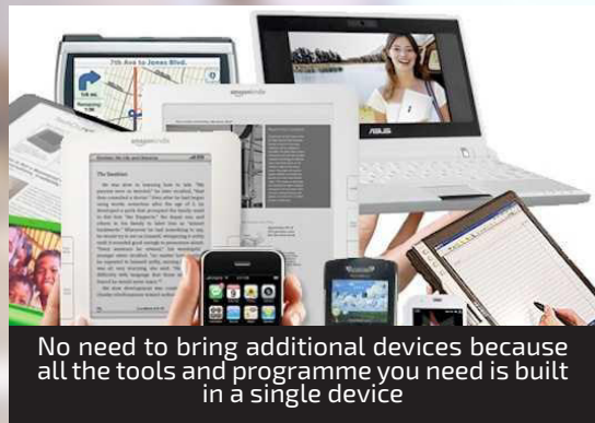
No need to bring additional devices because all the tools and programme you need is built in a single device