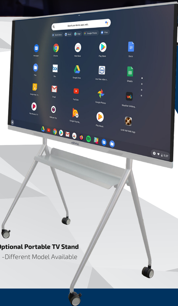
Optional Portable TV Stand -Different Model Available

ARV500 Series : Sizes 55", 65", 75", 86" Excellent companion in Google Workspace for Education